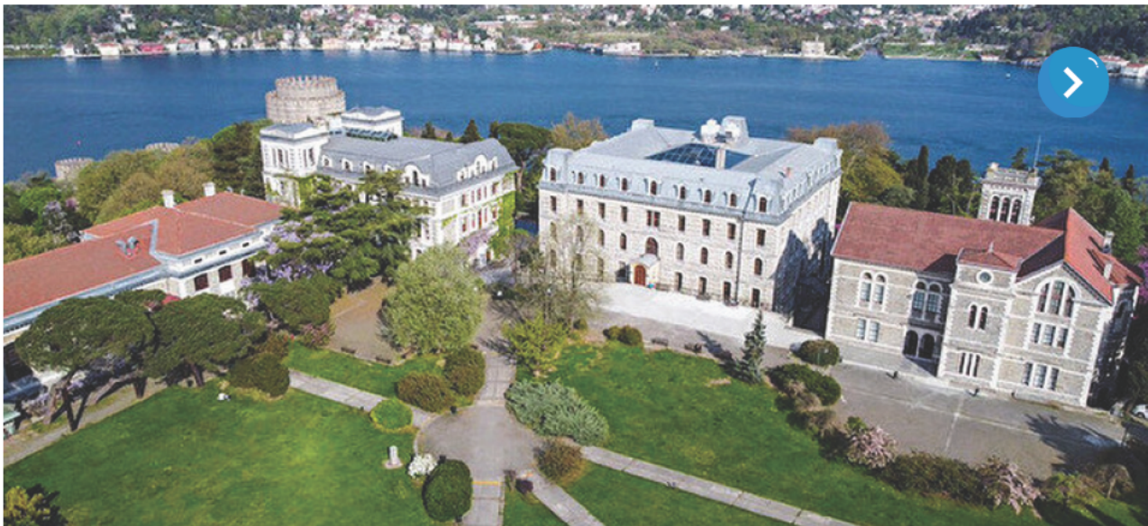
Boğaziçi University - South Campus (left building in the back is the management building)